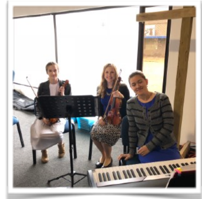
The makings of our own orchestra! Two violins & a piano for Sunday music!

I was a little concerned that they might demand that we endorse the views of the Anglican Church in order to use the building, but thus far they have only expressed that they want a good church to use it moving forward. It is a fantastic building, with a 200 seat auditorium, a large hall, and various classrooms here and there. It would be a little big for us (we currently average around 60 a week, with a high day of 81), but we would be so excited to have a place that we can “grow into” over the next few years. We are still in the negotiating stage concerning whether or not we will actually be able to lease it, but we are praying that the Lord might allow us to use this building for His glory!