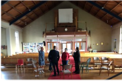
The interior of a potential new meeting place...please pray we will have wisdom