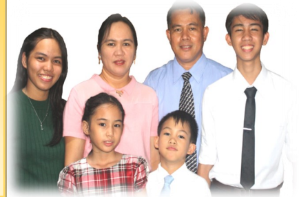
THE MAUSISA FAMILY