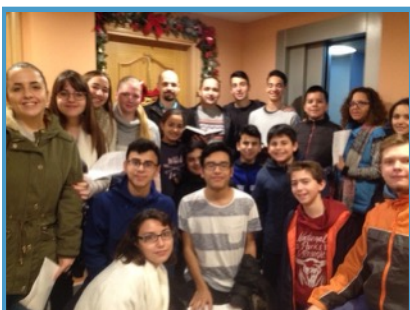
SINGING GROUP OUT IN OUR HALLWAY

I N We shared a special time during the holidays with the part of our family that is close by and with others by phone, email and Skype who are scattered all around the world serving the Lord. All those cards and letters from you, our friends and supporters, were appreciated as well. We are already looking forward to Spring to be able to get back out to camp to do maintenance and finish up several projects. Today the province of Guadalajara had the lowest temperature in the entire country: 12° F. Not very tropical!