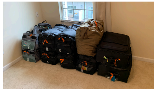
Bags Packed and Ready to go!

That is one of the moving pieces in the attempt to get back to Thailand ASAP, so I will just try to delineate some of them here and ask you to pray with us so that we could return as soon as possible!