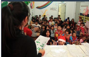
Classes before Corona