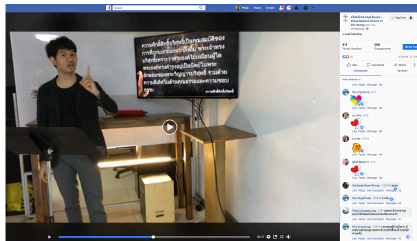
Live Stream in Thailand during Coronavirus

When things started getting locked down, we were in a missions conference in Illinois, and in the middle of the conference the events of the conference were cancelled, and they moved to online-only services while there. It was definitely the most unique conference we have been in! The next week we were scheduled to be in Ohio, but that was also cancelled. Most every meeting we had scheduled before going back has cancelled, in fact.