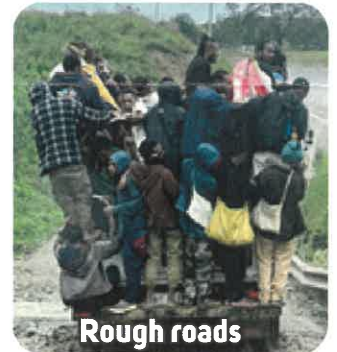
Rough roads and bad bridges