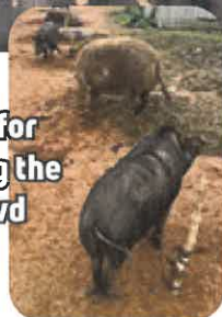
Pigs for feeding the crowd