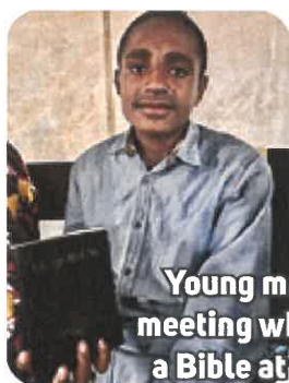
Young man at tent meeting who received a Bible at his school