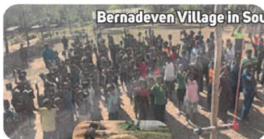
Bernadeven Village in South Fly in the Western Province