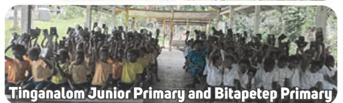
Tinganalom Junior Primary and Bitapetep Primary