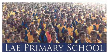
LAE PRIMARY SCHOOL