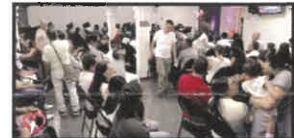
Our newest church, Ágape, has had standing room only for most services!