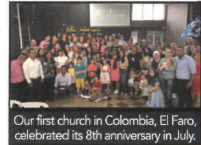
Our first church in Colombia, El Faro, celebrated its 8th anniversary in July.

"But I have all, and abound: I am full, having received of Epaphroditus the things which were sent from you, an odour of a sweet smell, a sacrifice acceptable, wellpleasing to God. But my God shall supply all your need according to his riches in glory by Christ Jesus." — Philippians 4:18-19